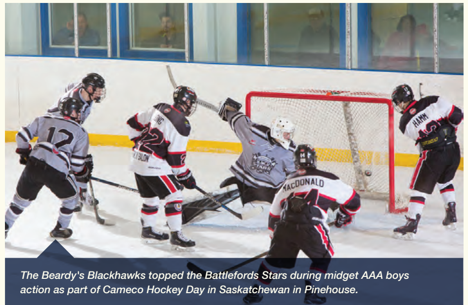
The Beardy's Blackhawks topped the Battlefords Stars during midget AAA boys action as part of Cameco Hockey Day in Saskatchewan in Pinehouse.