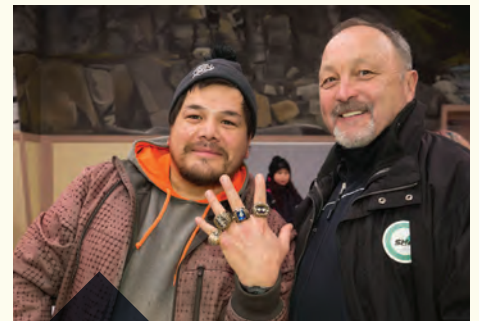
A Pinehouse fan gets a closer look at some of Bryan Trottier's Stanley Cup rings (he has seven total) during Cameco Hockey Day in Saskatchewan.