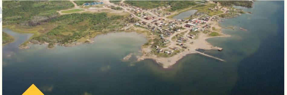
Fond du Lac is a northern community on the east side of Lake Athabasca.