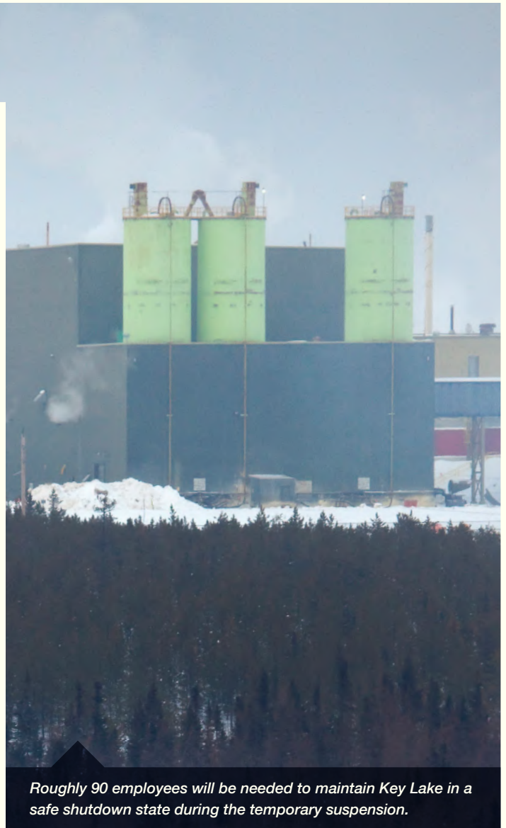
Roughly 90 employees will be needed to maintain Key Lake in a safe shutdown state during the temporary suspension.

Cameco remains committed to safety. All safety, radiation and environment programs and performance will be maintained during suspension and the company will continue to comply with all licences and continue reclamation activities.